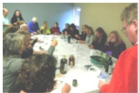
We're all busy earning 2 CEUs